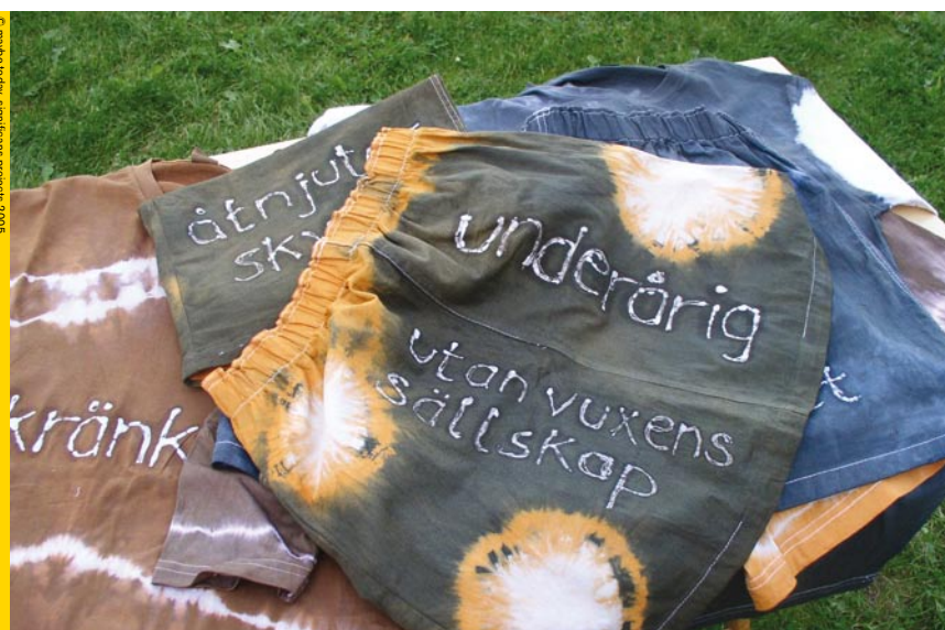
e maybe today, significant projects 2008

As regards asylum reception, a number of incidents took place in recent years which revealed serious problems in the Swedish Migration Board's reception system and which received much attention in the media and political sphere. The former government announced, at the time, their intention to appoint a commission to review asylum reception. The new government will fulfil this intention, as noted in its Budget Bill for 2007. NTN Asylum welcomes these initiatives and refers to its report on organisational separation between asylum reception and asylum evaluation which NTN Asylum's reference group submitted in spring 2006 to the then Minister of Migration.