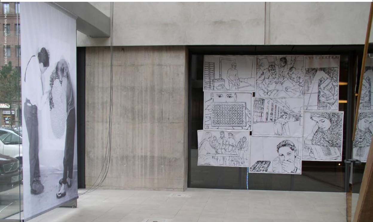
The significans artist group’s installation at the Museum of World Culture in Gothenburg, Sweden

Such a meeting place has now been created in NTN Asylum & integration’s new premises in Stockholm.