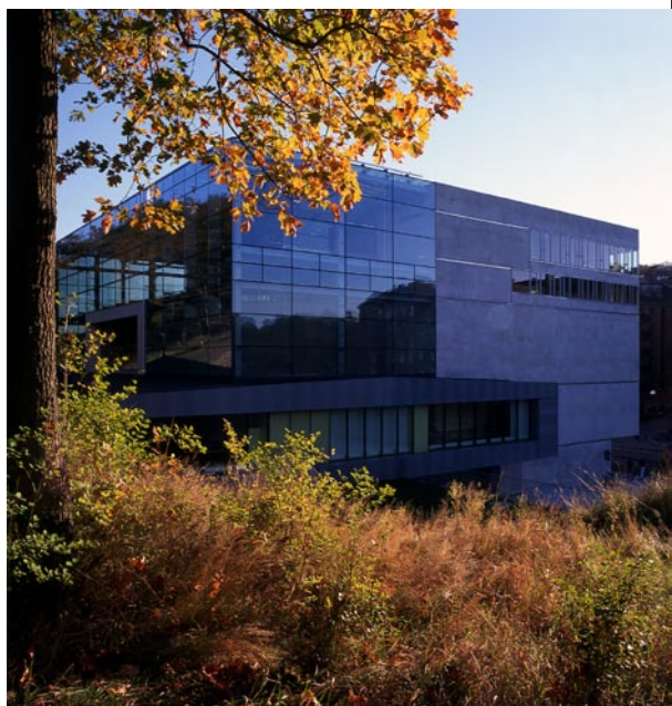
Museum of World Culture in Gothenburg

The first national and European conference on the asylum theme - Coming from afar - dealing with asylum and refugee reception in Sweden and Europe, was held in October 2005 in cooperation with the Museum of World Culture in Gothenburg, Sweden. The conference embodied a broad and unique focus on showcasing good practices and positive results from EQUAL (from national and transnational partnerships) and from the European Refugee Fund. Other elements included presentations and analyses of systems and policies in the asylum and refugee area at national and EU level as well as a number of research seminars with participants from Sweden and other Member States. The conference was given an artistic backdrop through a co-operative effort with the European artist group Significans , the magazine Karavan and the Gothenburg City Theatre. For the European Refugee Fund the conference was a choice opportunity to launch their new programme period. For EQUAL it was also a good opportunity for new projects to publicise their