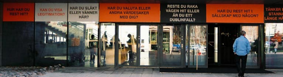
The significans artist group's installation at the Museum of World Culture in Gothenburg, Sweden

A number of research studies are being carried out within the frame of NTN Asylum. These studies aim to provide a more sound basis for continued work in mapping, analysing and developing asylum and refugee reception systems and policies. The studies will also serve as a reference for the efforts of various Development Partnerships and projects. Knowledge building through research is an important objective under the asylum theme, as noted in programme documents and project objectives.